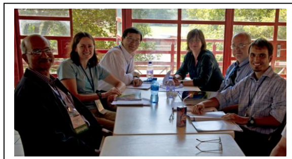
GeoSciEd VI - IGEO Senior Officers