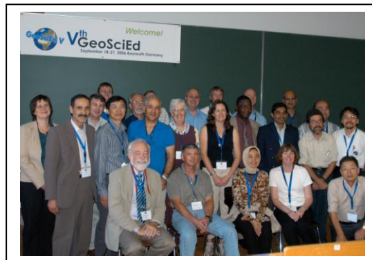
GeoSciEd V delegates.