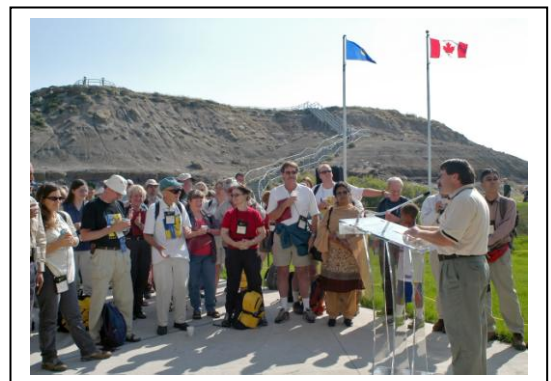
GeoSciEd IV delegates at the Royal Tyrrell Museum of Palaeontology, Drumheller, Alberta.